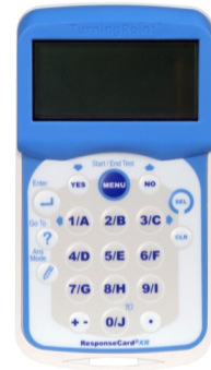
XR ResponseCard RF User's Guide

Customer Service Email: support@turningtechnologies.com