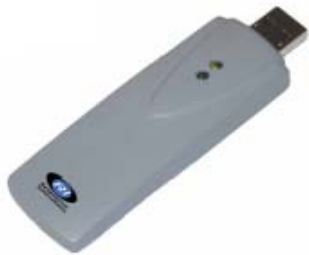
RF Receiver (USB)

Writing the activation code to the receiver