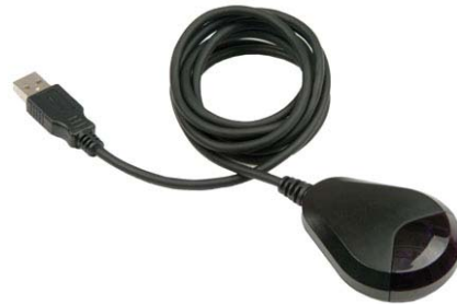
IR Receiver (USB)